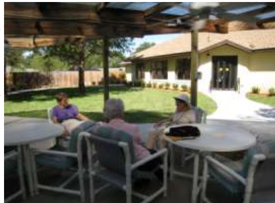
Hagen Volunteers Relax in the Hagen Garden Area