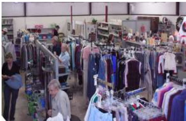
Shoppers Look for Bargains in the Clothing Department

By 1973, the Rummage Sale had a new home in some old school buildings that used to occupy the land behind the current Post Office. Twenty-one years later, however, those buildings had to be abandoned for safety concerns. A new name and place, Thursday Treasures, was created in 1998 to advertise the sale day, and the location was in Hedinger Hall. The operation was now a weekly event. Finally, in 2002, the present name and a permanent location became a reality for the Resale program. Friday afternoons and Saturday morning were the new store hours . It keeps getting better. In 2008, Resale has seen improvements including a new entrance, store layout, and total air conditioning for the safety and comfort of the growing customer base.