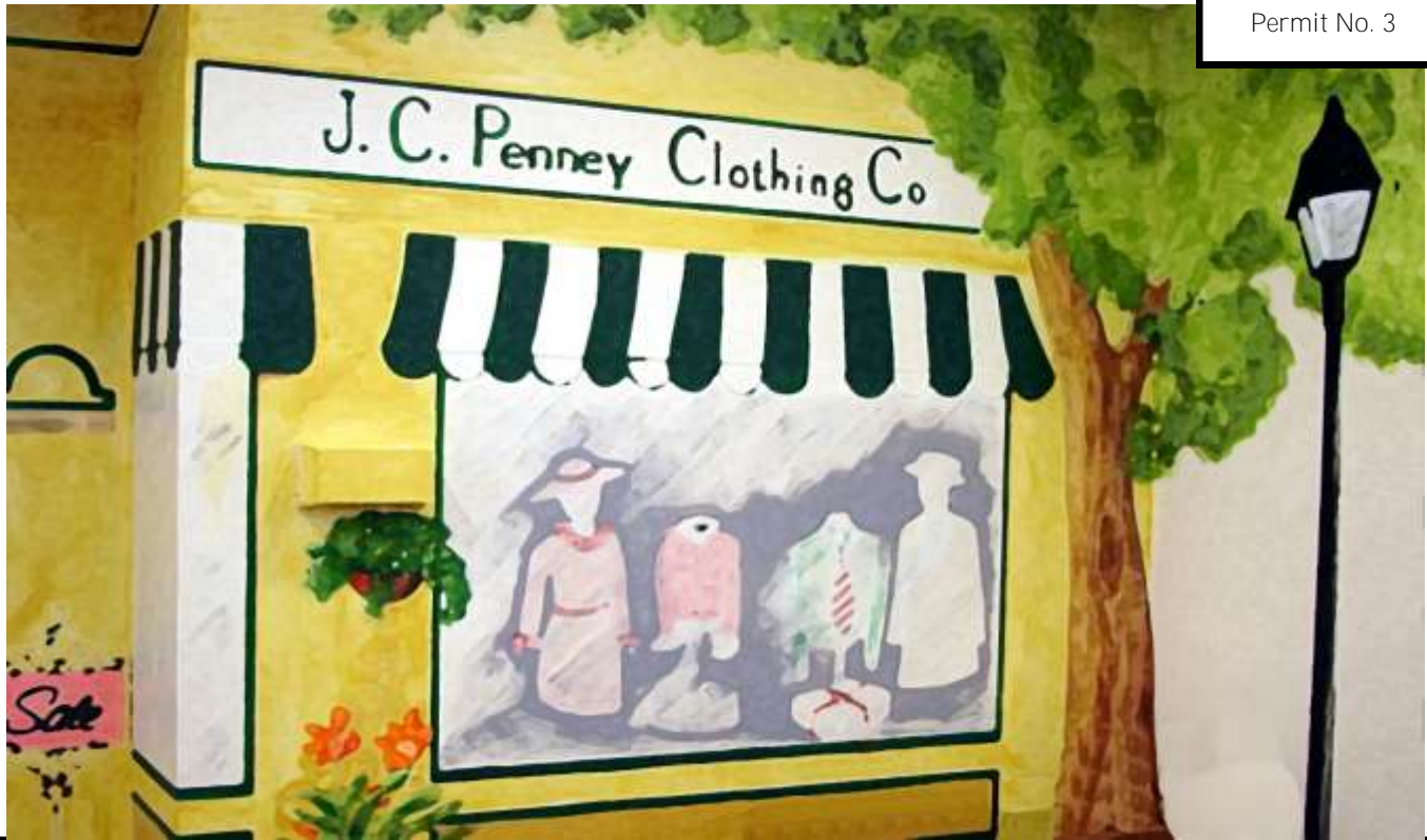
Sir, Madam, Watch Your Melon!

NON-PROFIT ORG. U.S. POSTAGE PAID Penney Farms, FL Permit No. 3