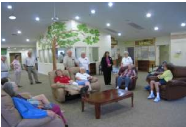
Hagen Care Volunteers Enjoy the New Activity Room Addition